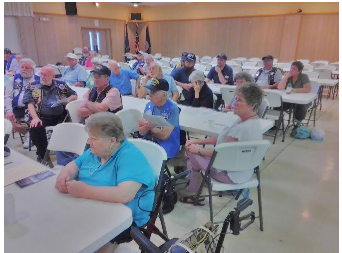
Some of the members and wives who attended the meeting (we had 35 attending)