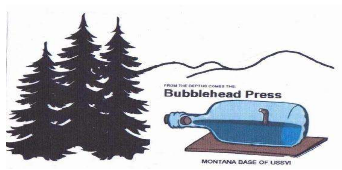
Issue 5, Winter 2015