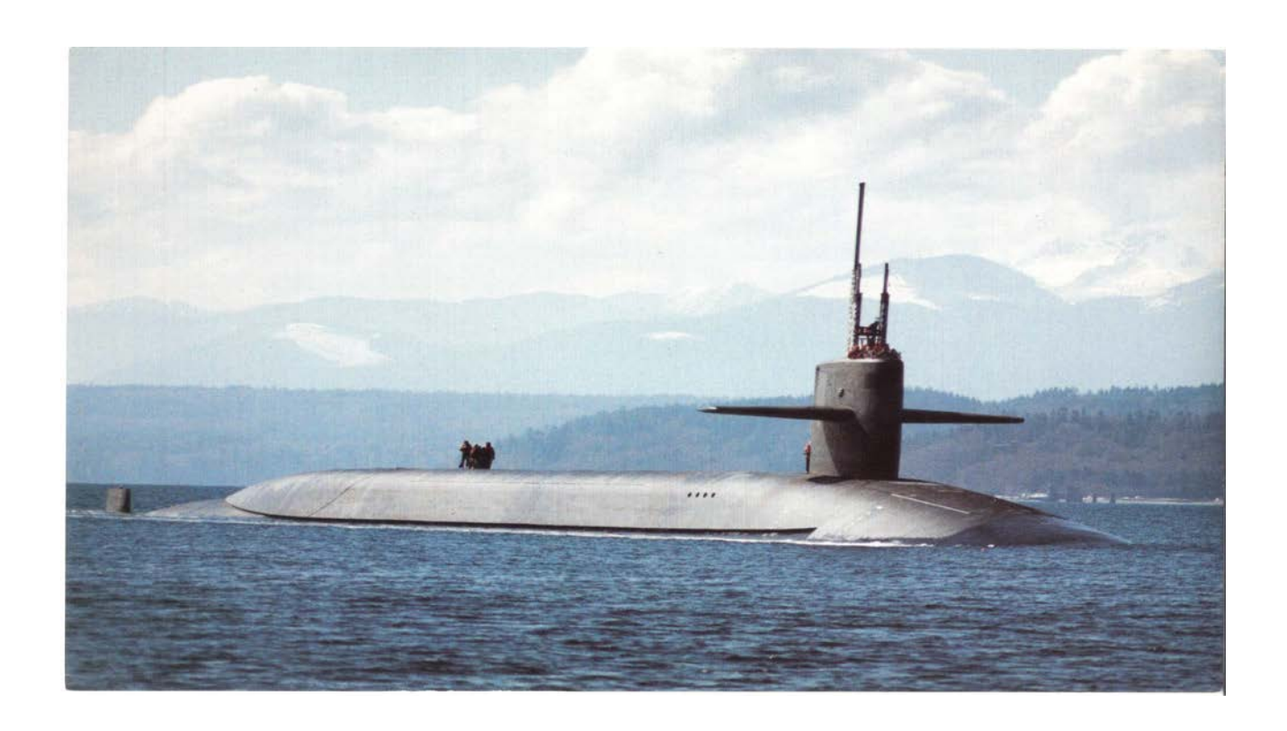
USS Alaska SSBN 732 Reunion Special Report by Steve Hoover

Item 3. EXEC BD 11:00, LUNCH NOON, MEETING 1300 SEA STORIES ALL DAY, SILENT AUCTIONS 1100 HRS TIL Halftime of meeting. 1/3, 1/3, 1/3 drawing till half time. 1/3 to winner, 1/3 to BASE and 1/3 to CHARITY VOTED ON BY MEMBERS