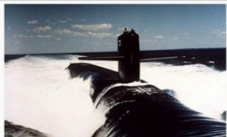
USS Nevada (SSBN-733) off the United States East Coast on her commissioning day, 16 August 1986.